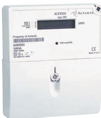
▶ ACE1000 type 280